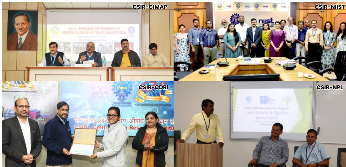
IMAGES: Various Skill Development Training Programs at different CSIR Labs.